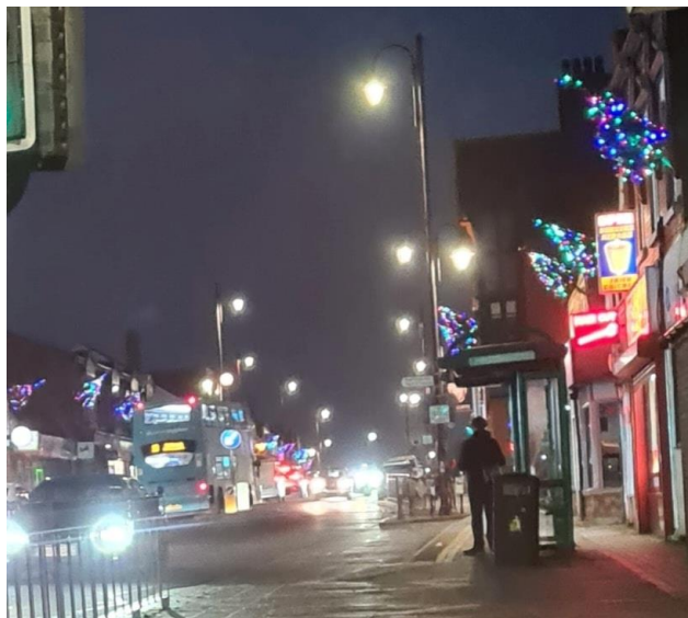
(The Christmas tree light displays along the high street in Shotton.)